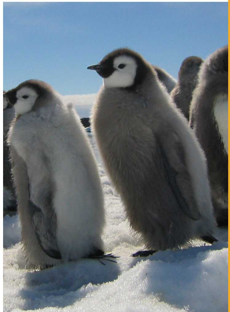
MARCH OF THE PENGUINS

35-55 players total. Strings, 3 Winds, 4 Brass, 4 Percussion, 1 Piano, 1 Harp, 1 Synthesizer.