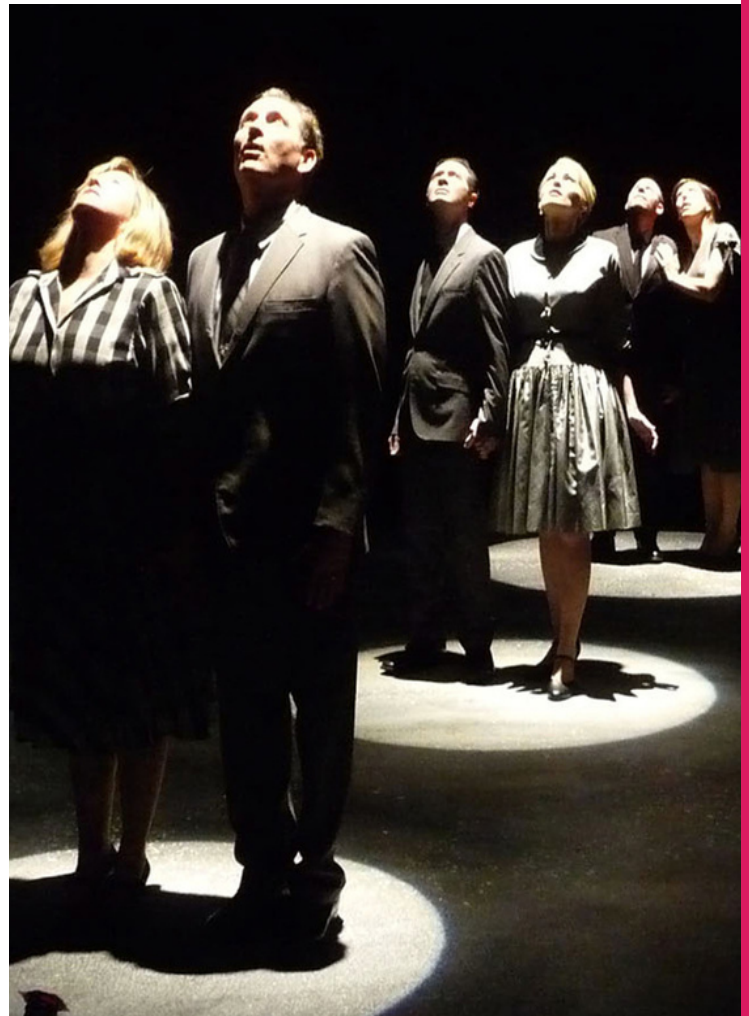
LA IMPRO THEATRE

Programs include Shakespeare UnScripted, Jane Austen UnScripted, Twilight Zone UnScripted, and Fairytales UnScripted. Residencies and masterclasses are also available.