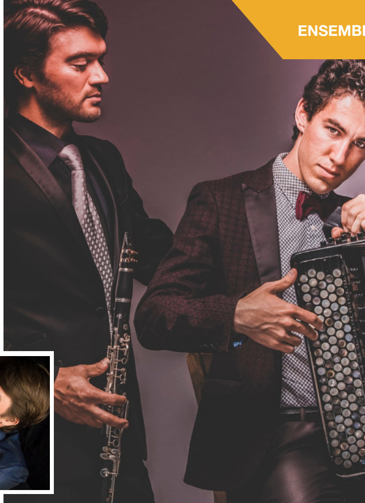
BRIDGE & WOLAK