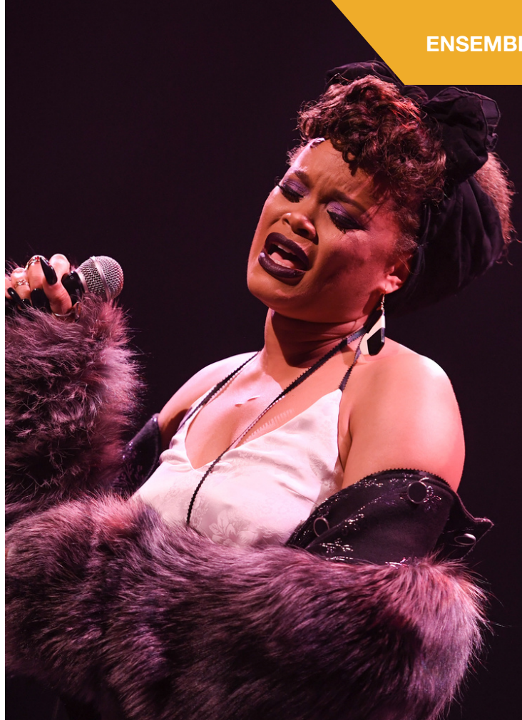
CELEBRATING ELLA: LIVE FROM THE APOLLO

CELEBRATING ELLA, Live from the Apollo is presented in partnership with G Studio Digital, Concord Records, New York's Apollo Theatre, and the Ella Fitzgerald Charitable Foundation.